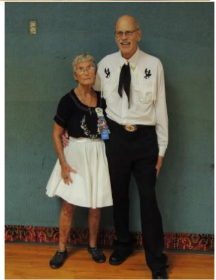
Fun pictures from the ASSDF Fall Festival